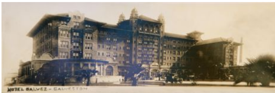
Hotel Galvez Circa 1911 (483KB)