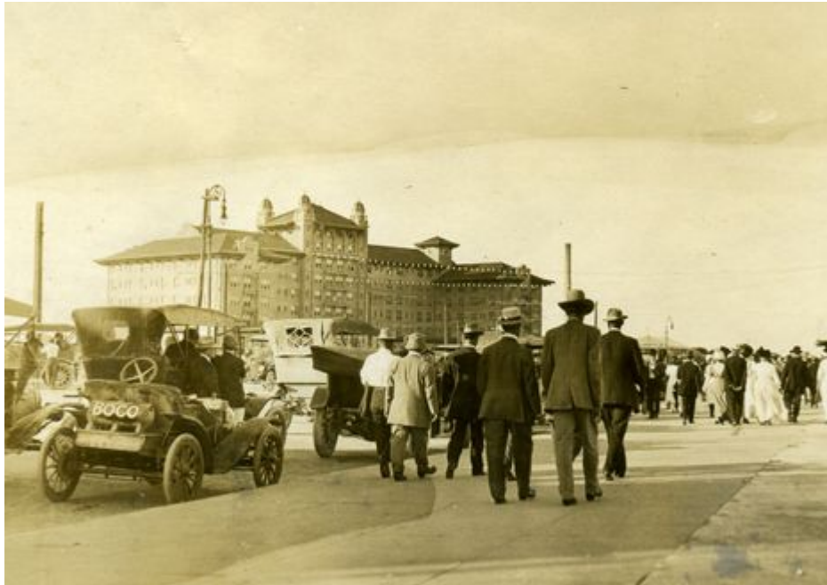
Hotel Galvez C1911 (1452 X 1023, 837KB)