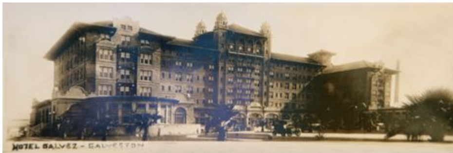
Hotel Galvez Circa 1911 (very high res)